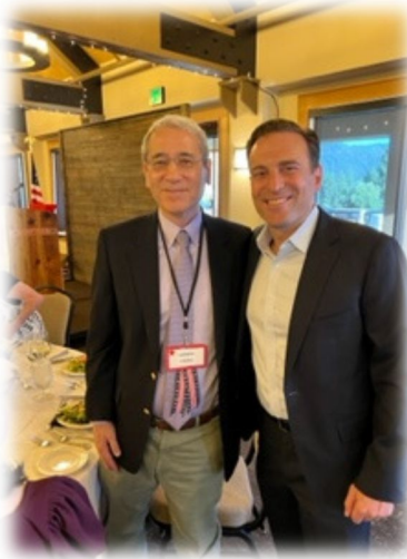
Gordon Chang, our guest speaker for our dinner Tuesday, August 30, 2022, and Adam Laxalt, US Senate candidate and former Nevada Attorney General.

A little club business. We have chosen the nominating committee and will vote on this committee at the September (Burnt Cedar) meeting.