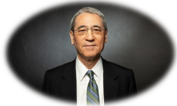
Gordon Chang is a world expert on China.

Gordon Guthrie Chang was born July 5, 1951 in New Jersey to a Chinese father and an American mother of Scottish ancestry. His father is from Rugao, Jiangsu, China.