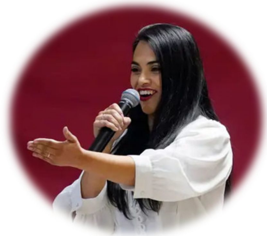
Mayra Flores campaigned for Congress in Harlingen, Texas, and won the special election to join Congress flipping the district from blue to red.

Mexican-born American Mayra Flores recently won a Congressional seat in a special election in South Texas. Mayra is one of the few Republicans to represent the Rio Grande Valley in modern history, as well as the first Mexican-born woman to serve in Congress. – Congratulations to Mayra and to Texas!