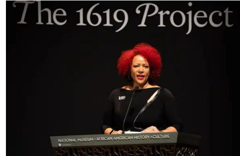
The 1619 Project founder Nikole Hannah-Jones

Thus the new book, like its magazine form released two years ago, fundamentally misunderstands the very issues it purports to shine light upon, namely slavery and its relationship to capitalism. "It rewrites history through a thoroughly racialized lens ... it makes [White supremacy] this undeviating commitment by virtually all Whites all the time, and it argues from a nationalist perspective that any progress Blacks have made, they've made alone," Mr. Oakes said. "It erases antislavery from American history. It thereby erases the antislavery history of the American Revolution. And for all practical purposes it erases the Civil War from American history," said Mr. Oakes, who said the book's introductory essay by Nikole Hannah-Jones focuses on Abraham Lincoln's racial views to the exclusion of his policies and attitudes toward slavery.