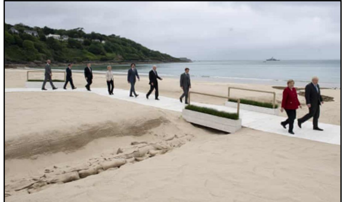
G7 world leaders in Cornwall led by Angela Merkel and Boris Johnson on 11 June.

Notable: This article has been shortened for inclusion in The Elephant's Tale.