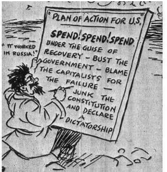
This cartoon was in the Chicago Tribune in 1934