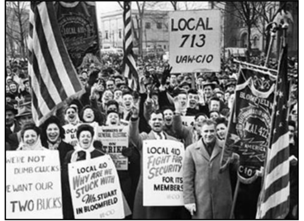
Local 713 and 410 UAW-CIO on strike for better wages