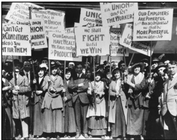
A union gathering in New York City in the early 1900s