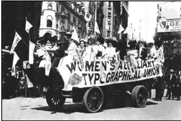
A Nationwide Holiday Women's Auxiliary Typographical Union